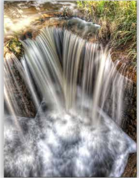
f/22 1/2 Second