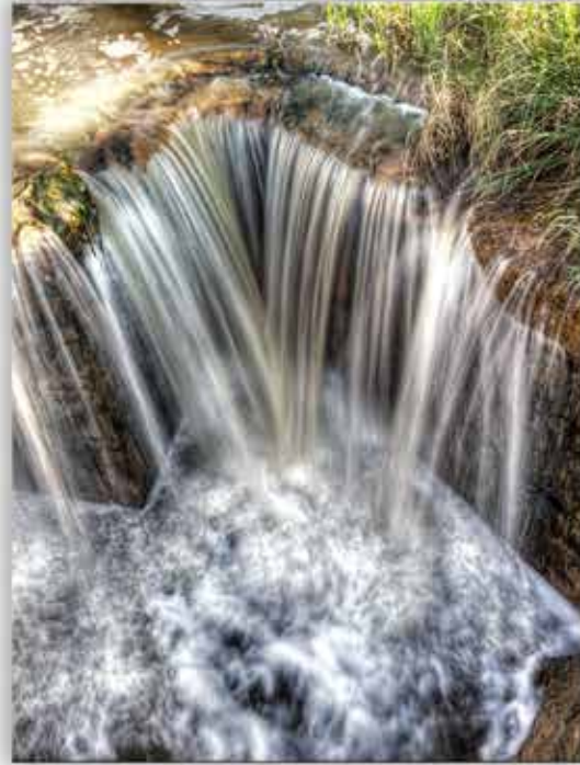
f/10 1/10 Second