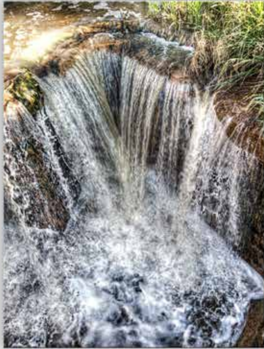
f/2.8 1/125 Second